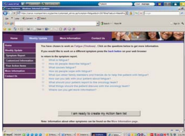
b) Information about fatigue.