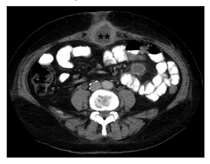
Figure 3. Computerized tomography image of metastatic umbilical mass