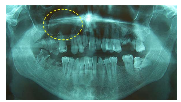
Fig. 2. Residual cyst in the first quadrant, displacing the sinus membrane