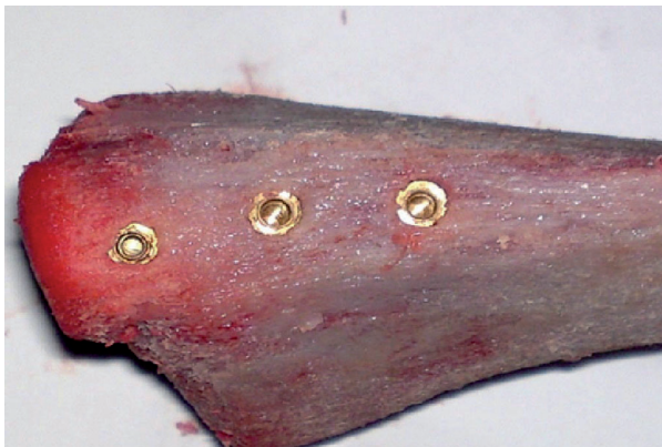
Fig. 2. The three dental implants in each preparation bed.

the bone drills used were sharp and were not used in a manner where excessive drill speed or pressure was involved. Saline was used for continuous irrigation of the implant site to minimize the amount of heat generated. At the end of the drilling process, an alignment pin was placed to confirm that the hole created met the needed alignment and depth requirements for the dental implant that was placed. After confirming the implant bed preparation, the implant was screwed into the implant bed to cover the rough area, using its own implant system screwing instruments (Fig. 2). The implants were seated in such a way as to completely cover the rough area. Then the transducer corresponding to each length of implant was inserted, pressing them down manually.