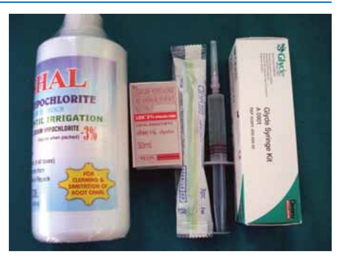
Fig. 2: Irrigation solution, syringe, glyde, local anesthesia