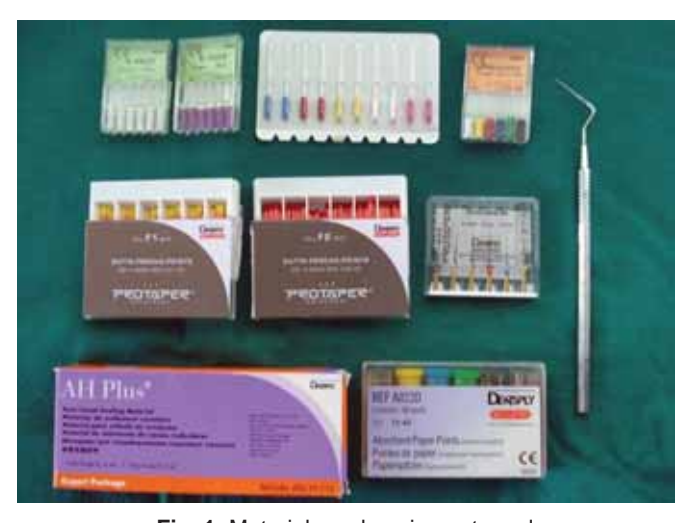
Fig. 1: Materials and equipment used

K-files, barbed broaches, rotary NiTi Protaper System, guttapercha points variable taper (Dentsply, Maillefer Company, USA), absorbent points, root canal sealer (AH-PLUS), root canal spreaders, root canal plugger (Fig. 1), irrigation syringe and needle, local anesthesia, irrigation solution (2.5% sodium hypochlorite), EDTA 17% (Glyde-Dentsply Maillefer, USA) (Fig. 2), rubber dam kit (Fig. 3). A total number of 32 single or two-rooted maxillary and mandibular teeth, i.e. anterior and premolars with straight canals were