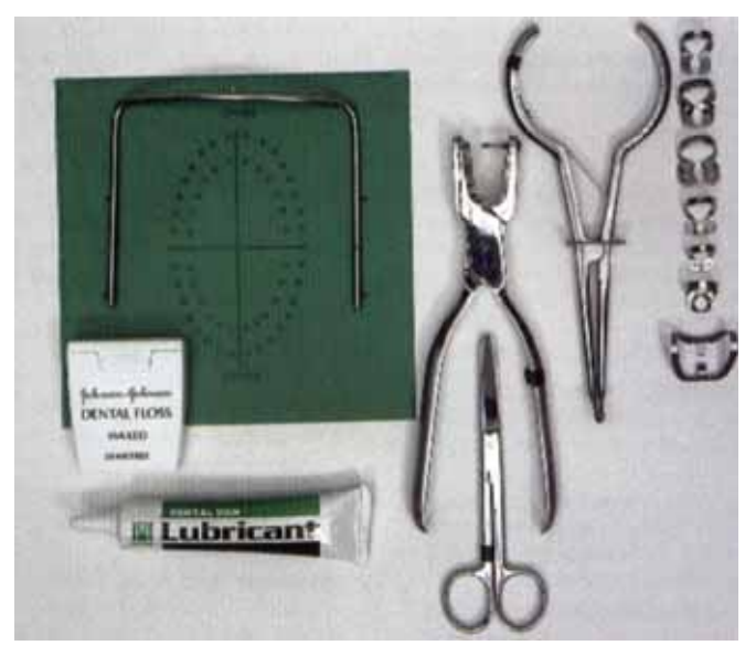
Fig. 3: Rubber dam kit

selected. Patient's medical history was taken as per the format. Medically compromised patients, i.e. diabetes, cardiac disease and other diseases were excluded from this study. Thirty-two cases were divided into the following four groups, group I—single-visit endodontic therapy (8 cases) with vital pulp involvement without periapical rarefaction, group II—single-visit endodontic therapy (8 cases) of asymptomatic pulpless teeth with periapical rarefaction as observed radiographically, group III—multiple-visit endodontic therapy (8 cases) of vital pulp involvement without periapical rarefaction, group IV—multiple-visit endodontic therapy (8 cases) of asymptomatic pulpless teeth with periapical rarefaction as observed radiographically.