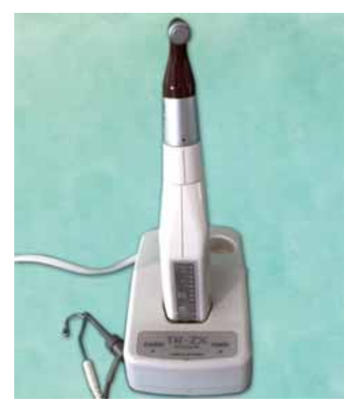
Fig. 4: Tri Auto ZX