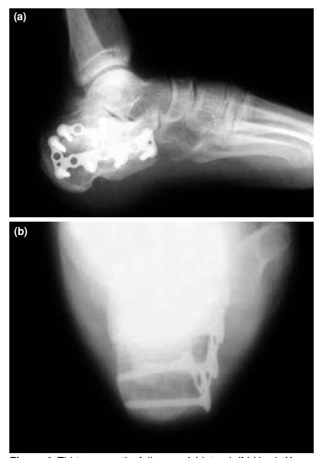
Figure 4. Thirteen months follow up; (a) lateral, (b) Harris X-ray.

good according to the Maryland scores and AOFAS criteria. Talocalcaneal joint arthritis was identified at the last visit by using hind foot CT (Figure 5).<sup>[12]</sup> We observed seven type I, six type II, and two type III talocalcaneal arthritis. No sural nerve-related