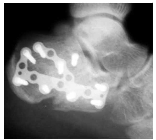
Figure 3. Postoperative lateral X-ray.

Complications were categorized as minor and major. There was no deep infection. Superficial infection was defined as minor complication and occurred in three patients (20%). All were treated by local wound care and oral antibiotics. Another three cases had wound edge necrosis. However, two of them healed by wound care seamlessly, but one did not. The hardware was exposed at the second month postoperatively. The patient was then referred to a plastic surgeon and facio-cutaneous flap was performed. The patient was seen at the outpatient clinic at four months postoperatively. The wound was closed and he was pain-free and function result was