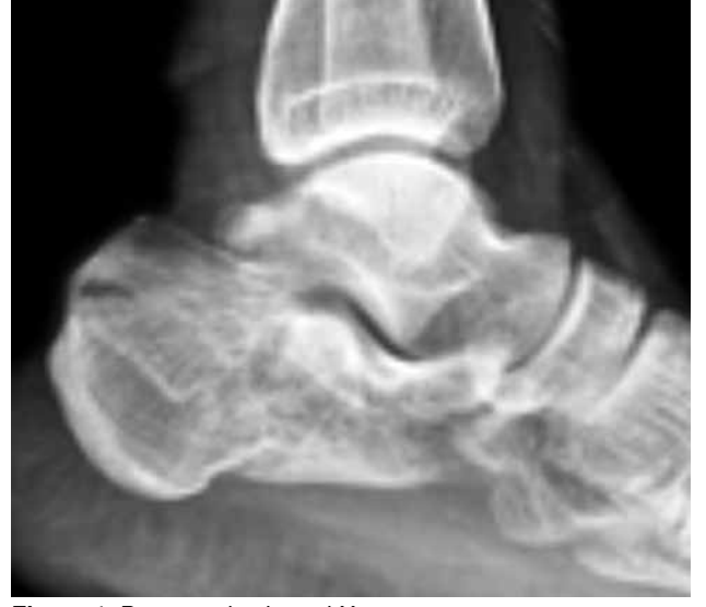
Figure 1. Preoperative lateral X-ray.

The mean preoperative amount of depression at the posterior facet joint line was 5 mm (4-7).