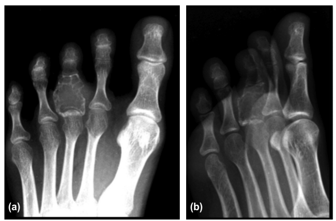
Figure 1(a), (b): Left foot radiograph shows expansile lytic bone lesion in the proximal phalanx of left third toe. Multiple septations can be seen within the lesion. The cortical margin of the bone remains intact.