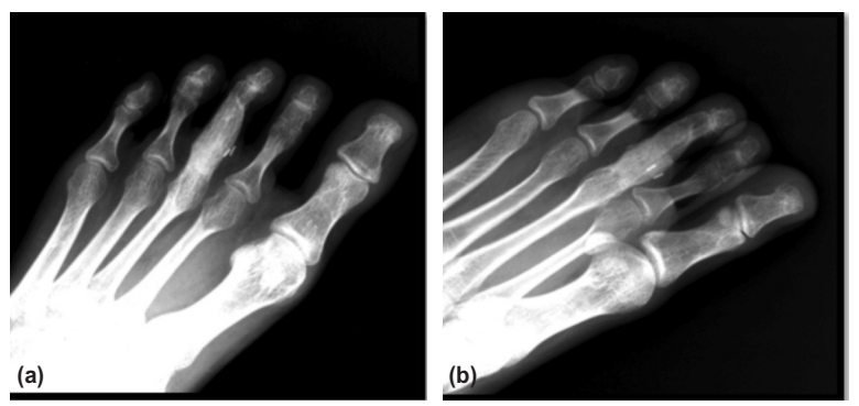
Figure 3(a), (b): Left foot radiograph 8 months post surgery shows good healing process with no local recurrence.