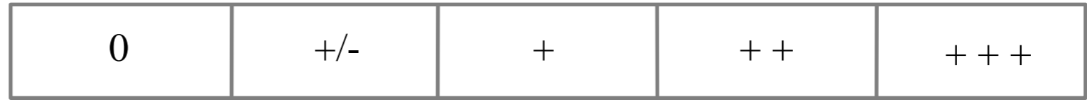
Reader 1: acid-fast bacilli per 100 microscopy fields