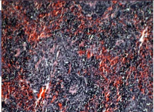
B – Spleen (week 6)