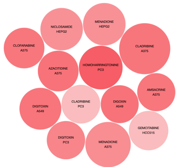
Supplementary Fig 1.