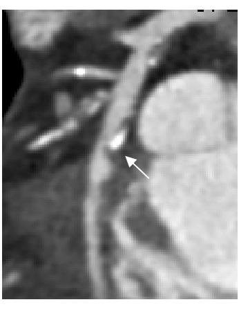
b) mixed plaque