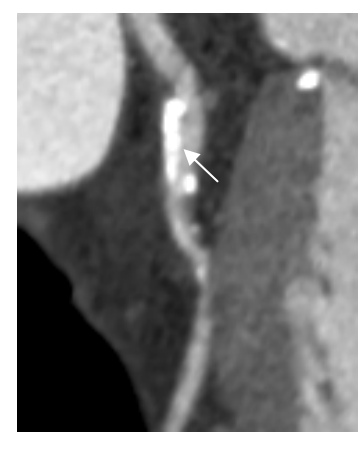
a) calcified plaque