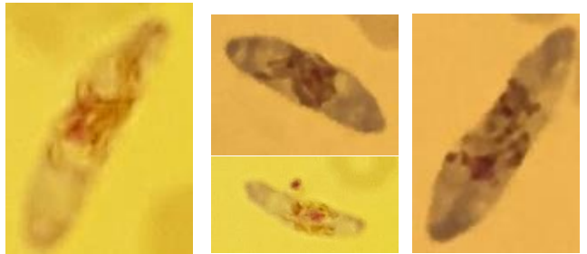
Additional file 3b