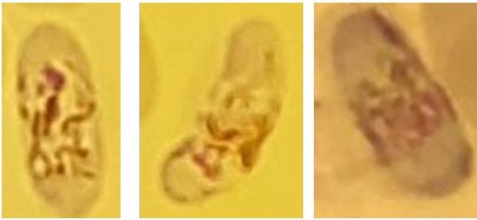
Additional file 3a