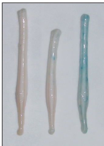
Naive C-stim + C-stim lidocaine