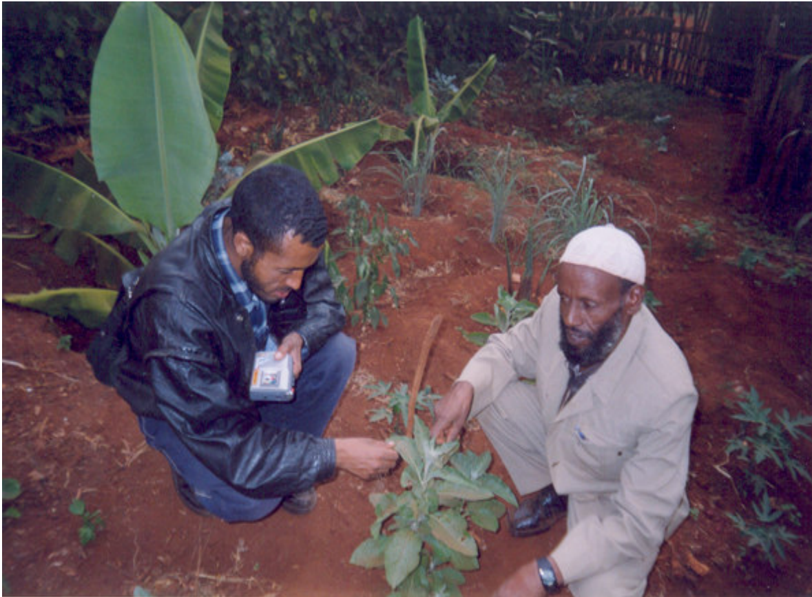
A well known traditional healer who is acting as the chair person of the practitioners' association demonstrating his medicinal plants planted in his home garden