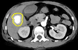
Contrast-enhanced CT for contouring target volumes.