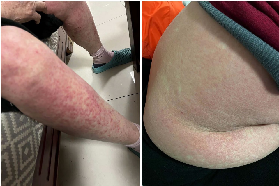
Supplementary Fig. 2 The drug eruptions and pruritic red macules were distributed to the patient's trunk and extremities.